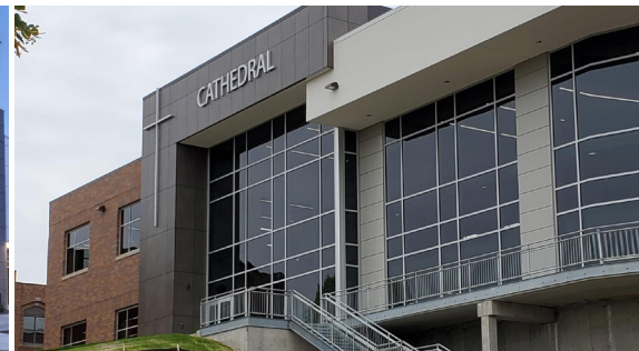
Cathedral High School